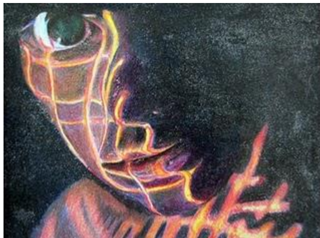
Branded by cross-bars

The special procedural rights and competences of the Commissioner for Fundamental Rights and his colleagues acting as National Preventive Mechanism are stipulated in Chapter III/A of Act CXI of 2011 on the Commissioner for Fundamental Rights.