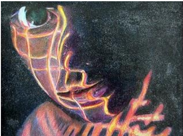
Branded by cross-bars

In Hungary, as of January 1, 2015 , the Commissioner for Fundamental Rights shall proceed as National Preventive Mechanism either personally or with the cooperation of his colleagues.